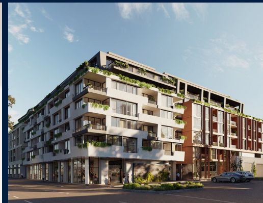
Roden : 2 - Bedroom